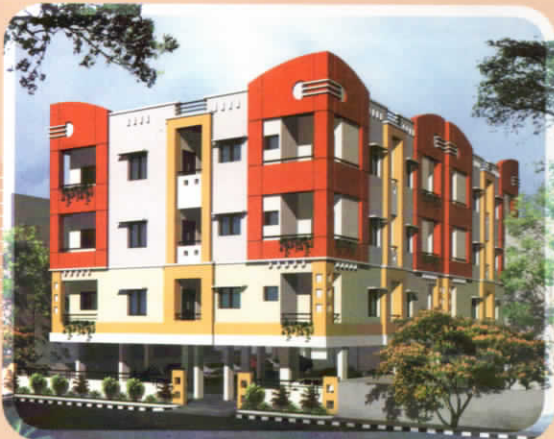
Guru Prudhvi Towers